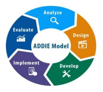
Figure 1. ADDIE Model

This research uses the Research and Development method. Educational research and development (R & D) is a process used to develop and validate educational products. In this study, the authors used the ADDIE model. ADDIE model was chosen because it is a recommended development model for developing learning tools (Mardiana et al., 2021). This study adapted the ADDIE model from Richey & Klein (2014), which stands for Analysis, Design, Development, Implementation, and Evaluation. It is a guide to developing the learning video for elementary learners. This model is commonly used to produce an effective design in the field of developing the media (Wahyuni & Tantri, 2020)